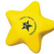
Stress Relief Star (D)