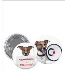
Buttons, 3-pack (E)