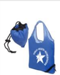
Tote Bag (E)