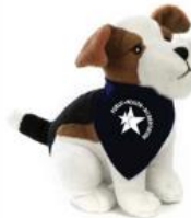
Plush Dog (D)